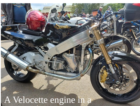
A Velocette engine in a Suzuki frame!

these are a couple of bikes I saw at Hoar Park recently: