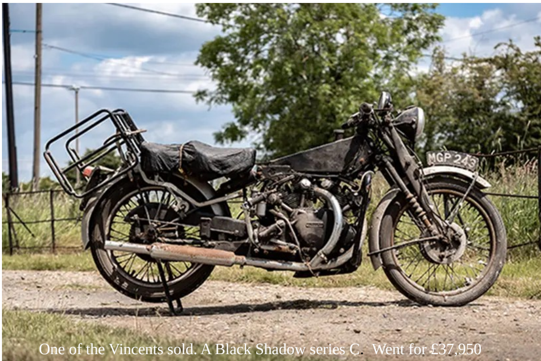
One of the Vincents sold. A Black Shadow series C. Went for £37,950

Banbury eligible bikes were selling from just a couple of thousand pounds.